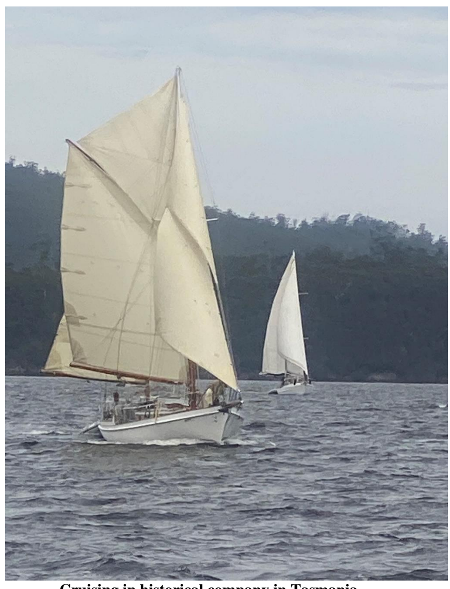
Cruising in historical company in Tasmania

NEXT GATHERING: XMAS DINNER - FRIDAY 16<sup>TH</sup> DECEMBER 7:30 P.M. SEE INFORMATION - PAGE 4